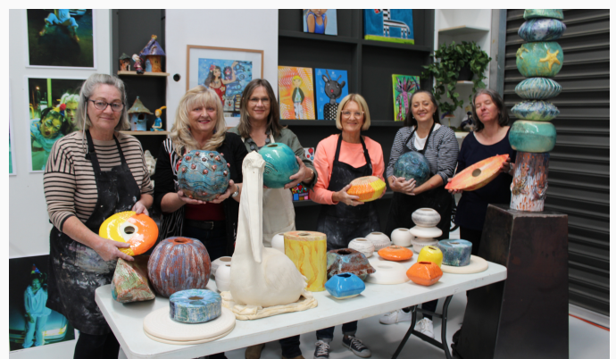
Artwork being created for outside the redeveloped Portarlington site